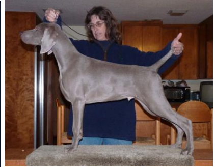
Cruiser – 5mos Jan 22, 2009