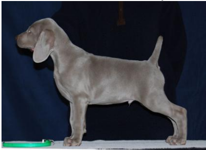
Max – 8wks