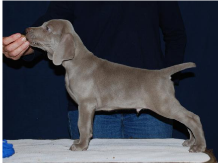
Cruiser – 7wks