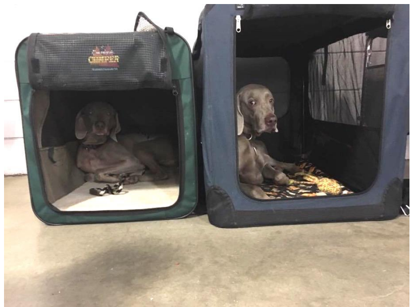
Kensi & Gibbs relaxing