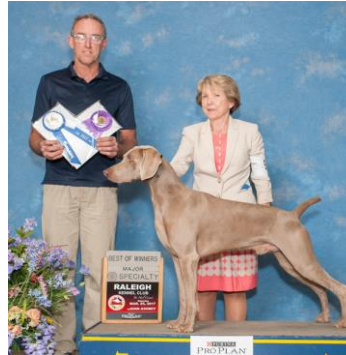
Chatawey's Son Of A Sailor NSD