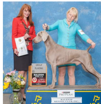
GCH Camelot's Luxe Winter's Waltz