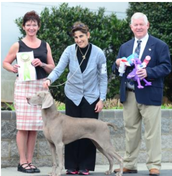
CH QuikSilvr Believe in Magic CD RN

Best in Veterans Sweeps: Ch QuikSilvr Believe in Magic CD RN, Ch QuikSilvr Bet on Tess JH