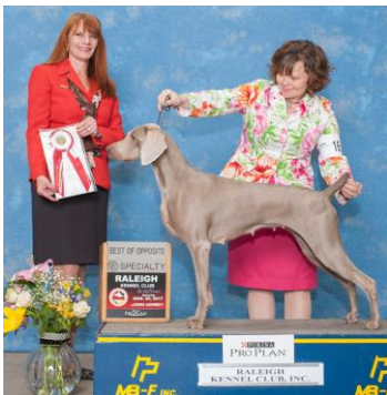
Zulla And Versa's Field of Dreams