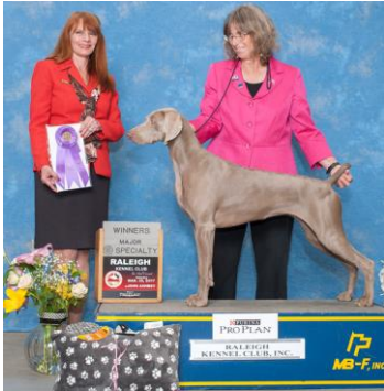
QuikSilvr You Go Girl JH